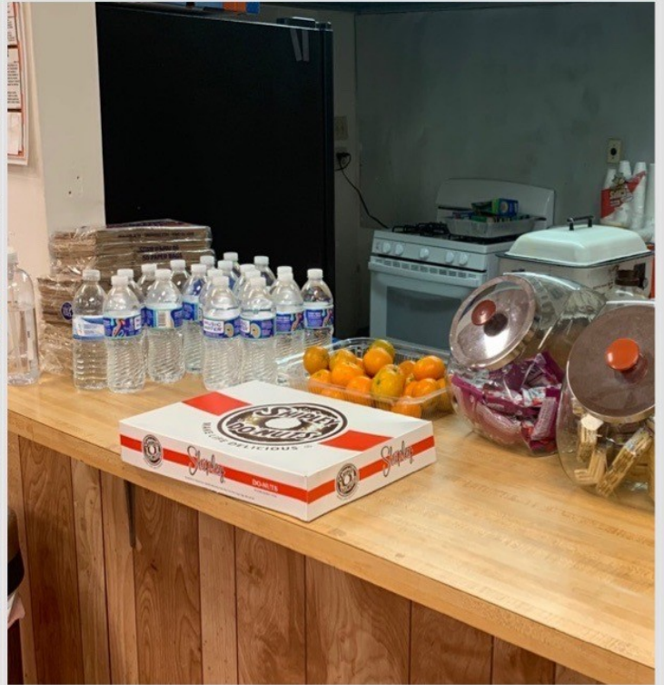
Team Rubicon Utilizes Post 586 for Houston Communities Storm Recovery